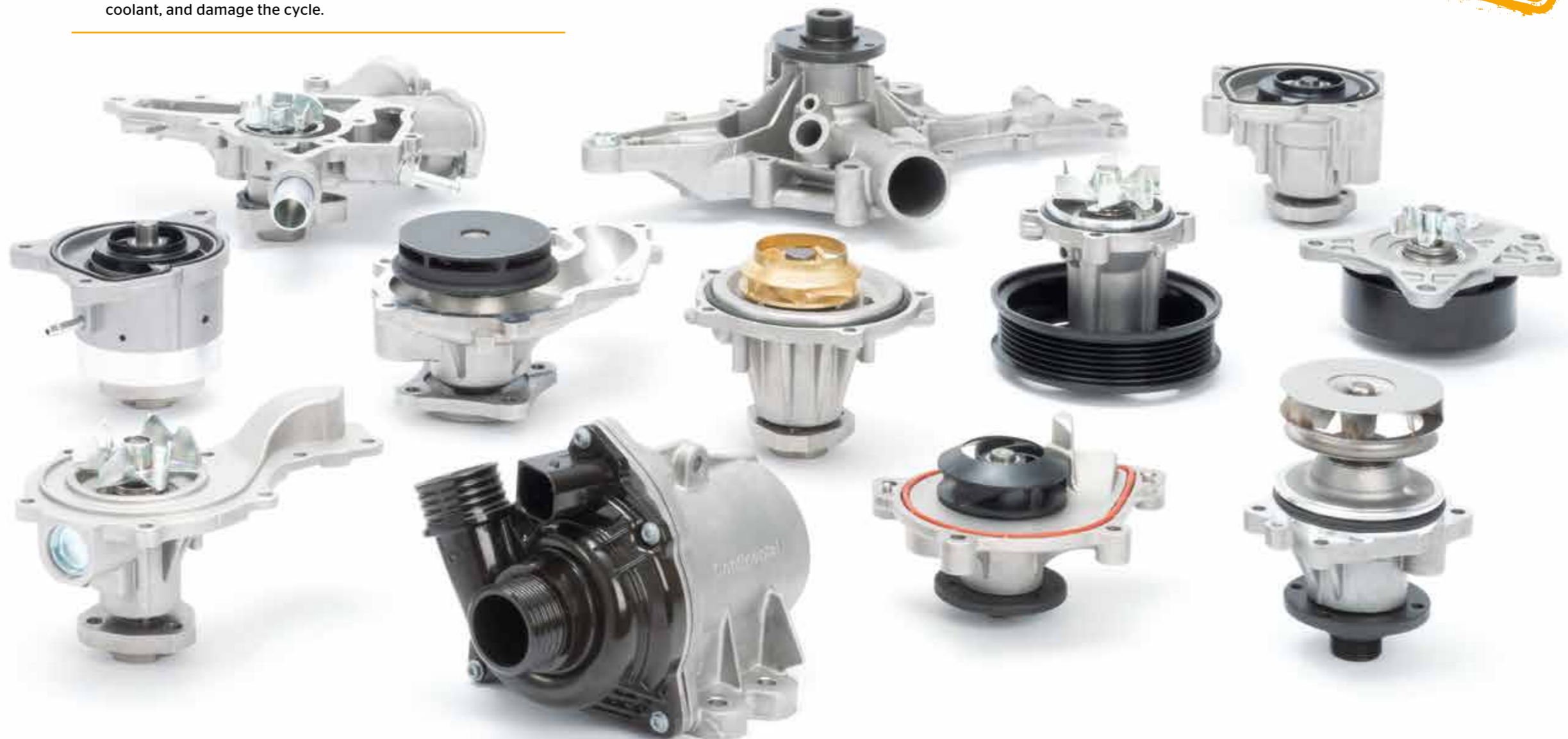
Comparison of water pumps from ContiTech, OES, and competitors